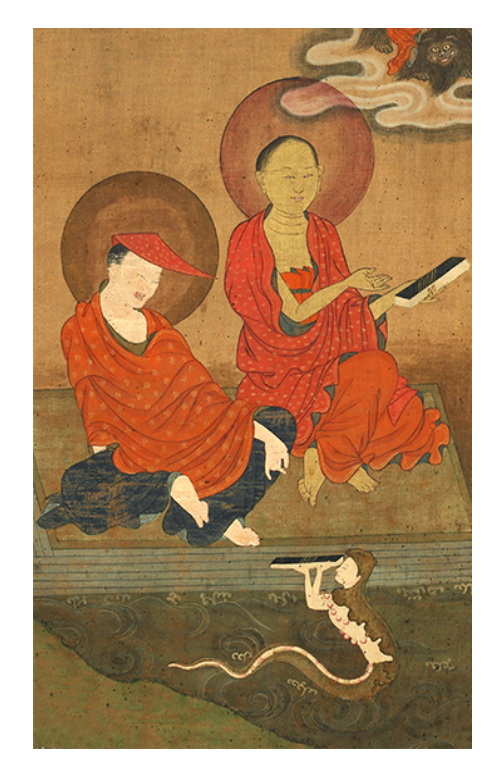
The Buddhist scholar Nāgārjuna and his disciple Āryadev. (Eastern Tibet, 19th c.)

Further and more detailed information about the Institute, its history, and its activities—including upcoming events—can be found at our website: <a href="https://www.oeaw.ac.at/ikga/">https://www.oeaw.ac.at/ikga/</a>.